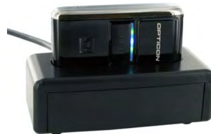
CMT-1 shown with OPN-2002 *

*scanner NOT included with the docking station