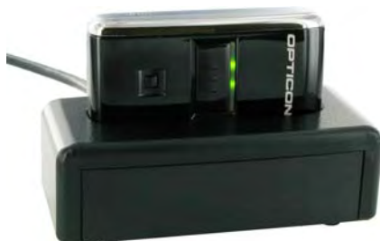
CMT-1 shown with OPN-2001 *

power supply : no power supply needed (feeds from PC's USB port) electrical : no electronic parts inside