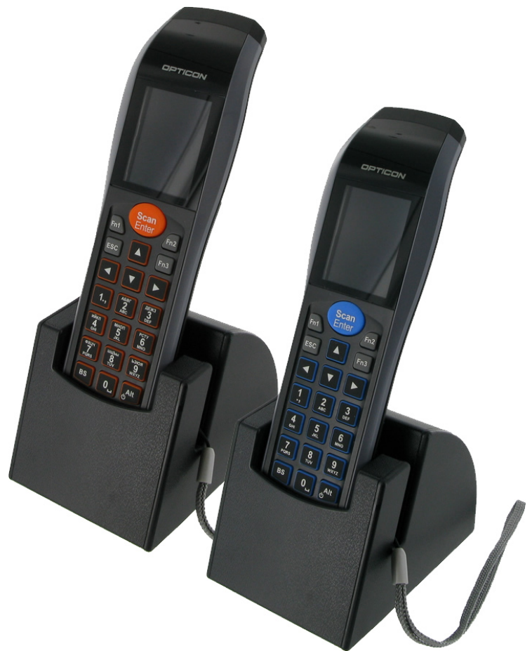
CLK-1 shown with OPH/CLK-300x* *terminals NOT included